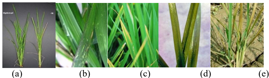
Figure3: Nutrient deficiency symptoms on paddy leaves (a) N, (b) P, (c) K, (d) Mn, (e) Zn

Colour separation: The colours of the photos are represented using the HSI (Hue, Saturation, and Intensity) colour model. The colour histogram shows how colour is distributed throughout an image. This stage involves computing the colour intensity of the leaves and displaying it as a histogram. One of the key parameters of the dataset under design is the colour intensity, which is also taken into account and kept [10]. The colour depicts the various vitamin deficiencies as seen in Figure 3.